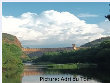
Hartebeespoort dam wall & Crocodile River

The IFHE Executive Committee Members are delighted to announce that the venue for the IFHE Council 2026 is South Africa. The SAAFECs (South African Association of Family Ecology and Consumer Science) invites the 2026 IFHE Council to be part of their international SAAFECs Conference in March 2026, at Mount Amanzi.