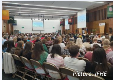
Audience during Keynote Session in Conference Room Bailey Allen