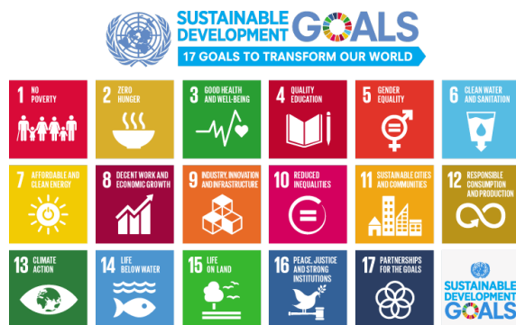
Figure 2 The United Nations 17 Sustainable Development Goals. (United Nations Department of Economic and Social Affairs, n.d.)

ecological aspects that impact every-day living and to offer specific interpretations of important SDGs” (International Federation for Home Economics, n.d.).