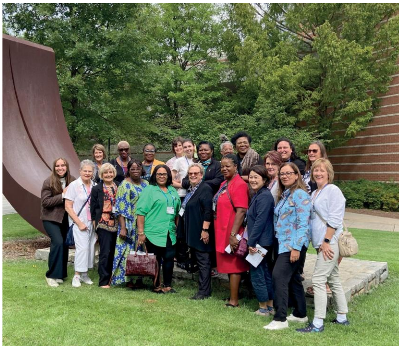
Participants at Learning Day on the Move

On the third day of the congress, the technical excursions offered a welcome opportunity to get to know projects and initiatives with home economics relevance in the region. Six groups returned full of enthusiasm, sharing impressions from their visits to the Atlanta Community Food Bank, the Jimmy Carter Presidential Library and Museum, a civil and human rights tour, a Home Economics classroom visit, a tour to an education farm and a trip to the University of Georgia's Textiles, Merchandising and Interior Design Department.