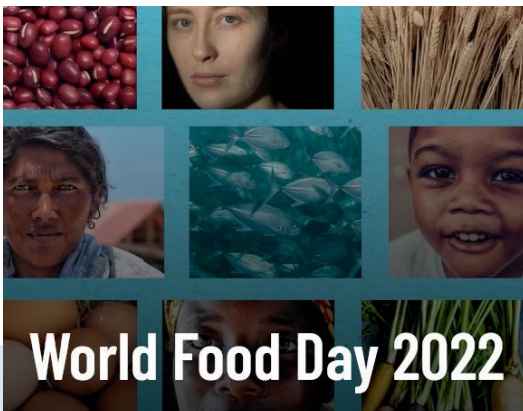
World Food Day logo 2022

Once again, many activities revolved around World Food Day . IFHE has been advocating healthy diets since 1908, continuously strengthening food & nutrition education. The interdisciplinary approach follows the Food and Agricultural Organisation's aim for a better production, better nutrition, a better environment and a better life for all. The FAO's warning to leave no one behind has long been the basis of home economists' understanding that our globalised world and -work has an effect on everyone.