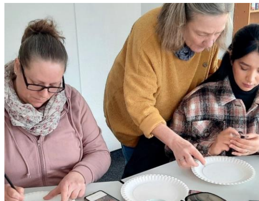
German association creating jobs to care for the elderly (see page 13)