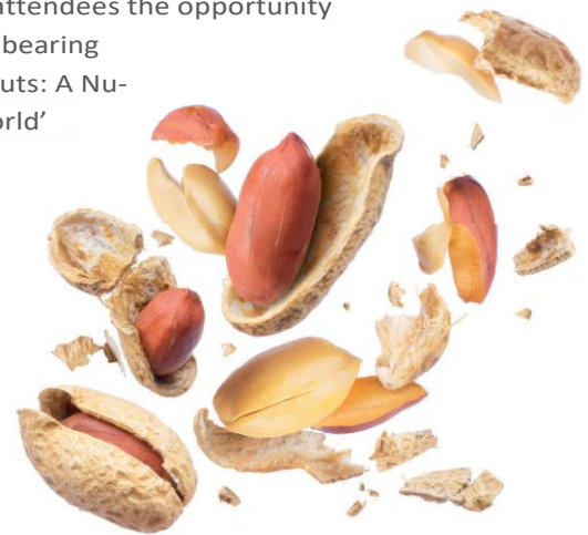
Learning Lab on peanuts as "nutrition powerhouse"

In the spacious EXPO Hall, congress participants could attend rotating best practice poster presentations or examine textile/design exhibits. The latter were often presented in the context of sustainable production practices and were published in a digital catalogue. The interactive character and the creative exhibition contributions made the EXPO a magnet for participants. This was also due to the Learning Labs, another innovative addition to the congress programme. These open learning spaces offered attendees the opportunity to discover new approaches, bearing such interesting titles as 'Peanuts: A Nutrition Powerhouse for the World' or 'En-ROADS, a Home Model for a Cooler Planet.'