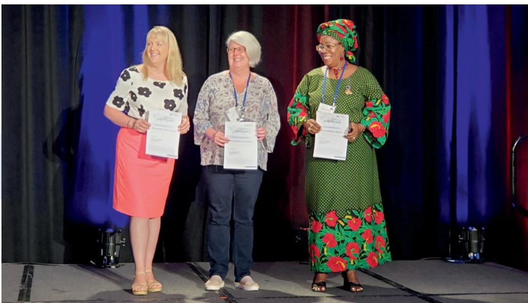
Certificate award ceremony