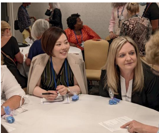
Expert group meeting at World Congress

In most societies, women are responsible for care work at home and were therefore often the ones who had to drop out of the labour market, for example because of school closures. They not only lost their jobs much more often than men did, this also led to negative effects on the labour market. IFHE has started to develop positions on this and will present them at the UN in 2023.